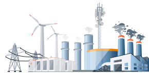
UTILITIES AND TELECOM

Nokē is transforming, streamlining and simplifying access control on gates, entry points, tool cabinets, valves, lockers, trucks and trains, self-storage, and beyond. Technicians and all stake holders open locks from their phones, managers have 100% visibility and control of the locks from anywhere, and everyone feels the benefits of the Nokē Smart-locking Security Platform.